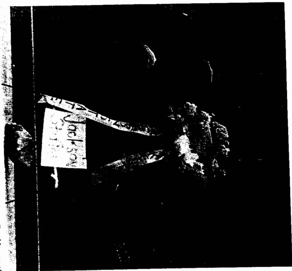
"Art Strike Against Racism, War, Oppression," on the steps of The Metropolitan Museum of Art, New York, May 1970.

Tomorrow night (September 21) there is a meeting of the AWC, the Art Strike, Soho Artists Association and an artists' housing group, the first of a season, the first of the AWC's third season, the first season after 2,000 artists gathered to protest Cambodia and Kent State and Augusta and Jackson and formed the Art Strike, the first of a season that promises to be low on the kind of social (as in socializing) stimulation generated by moneyed institutions. A lot of people know that their time this year might be best spent in the studio and in the streets. You have to be pretty far above it all to stay aloof. At the same time, the majority of the art world is afraid to take its bullshit out of the bars and into the streets, afraid of losing the