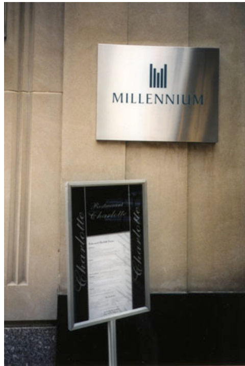
New York Times advertisement for the Millennium Premier Hotel, circa 1999 (artist unknown)