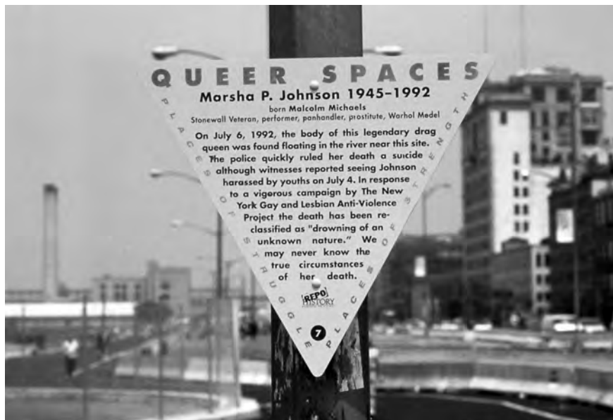
1994 REPOhistory street sign memorial for transgendered political activist Marsha P. Johnson (1945–92), located in the Meat Market area of Manhattan, one of nine placards making up the Queer Spaces project sponsored by the Storefront for Art and Architecture, NYC.

queen, describing her activism amongst the Meatpacking District’s transgendered subculture as well as her untimely death. The rose-colored testimonial’s presence was unusual, though unspectacular. It was a relatively small, text-covered object nestled among New York’s dense network of signs regulating parking, traffic, city utilities, and the movement of pedestrians. At the same time, its function was not regulatory. The “solemn” tone and serious-looking typography suggested an official historical marker. However, its shape and color undermined this reading because most official historic preservation takes the form of substantial bronze plaques or figurative statuary commemorating civic, military, or political leaders. It was a “queer sign” that commemorated an individual few had ever heard of and a city that was no longer visible. As though from the grave it summoned to light something missing, forgotten, and, in Johnson’s case, literally discarded. Its phantom jurisdiction briefly haunted one small corner of a gentrifying Meatpacking District, calling forth an other city, a spectral city, with its own, unremembered rules and regulations, myths and memories.