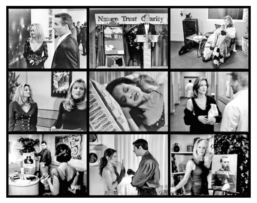
Nine instances in which Mel Chin and the GALA Committee placed artworks in scenes on the television show Melrose Place . The project, In the Name of the Place , was a collaboration between Chin, MFA students in Georgia and Los Angeles (hence GALA Committee), assorted other artists, and the set designers and script writers of the television show. The project was originally commissioned as part of the exhibition Uncommon Sense at the Los Angeles Museum of Contemporary Art, 1997.

opposition of the words relational and private sets the stage for a discussion of a new sort of work based on a framework of interaction rather than isolation: