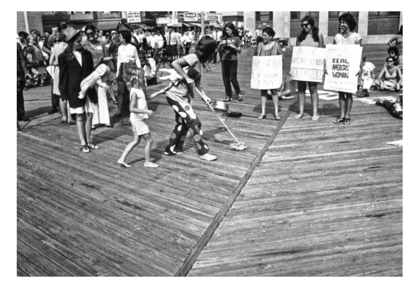
On the boardwalk in Atlantic City, New Jersey, New York Radical Women dispute the image of American women being presented at the Miss America pageant nearby. The action, which was suggested at a consciousness-raising session, gained national media attention in 1969.