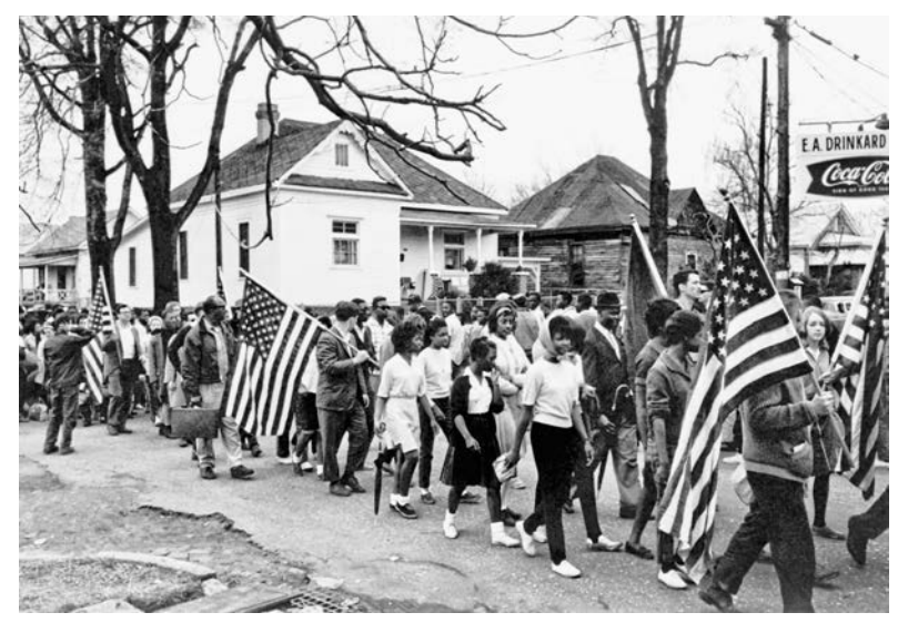
The civil rights march from Selma to Montgomery, Alabama, in 1965.

ment, 'compassionate and sympathetic personal relationships,' and other varieties of mouth-to-mouth resuscitation derived from the vocabulary of group therapy and progressive liberal witch doctors." Here the philosophy of cooperation is described as unsuited to the urgent work of resisting oppressive racism. This critique of cooperative action as accommodation and compromised liberalism is still leveled at socially cooperative projects, be they political or artistic.