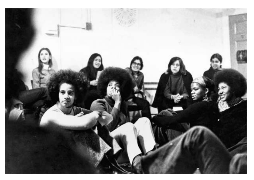
An early consciousness-raising session at the Women's Center in Greenwich Village, 1970.