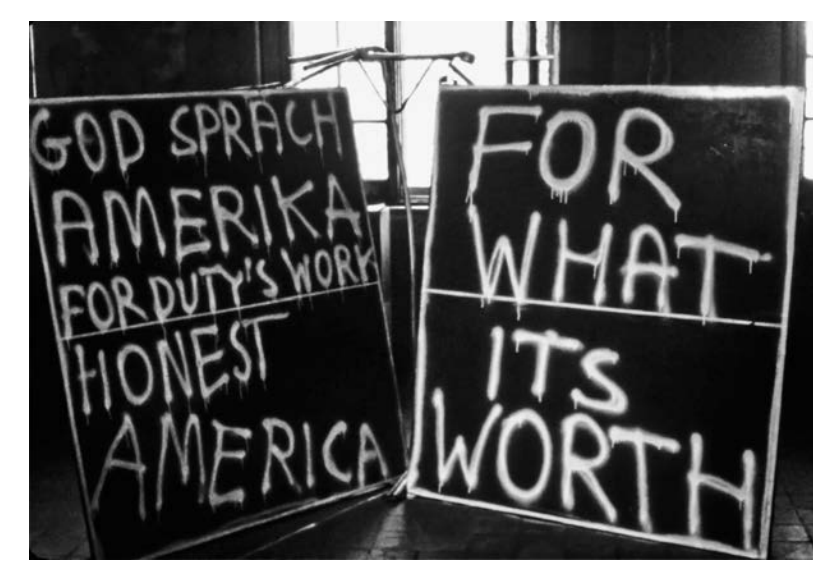
A short poem spray-painted on two sheets of plywood in a corner of the Living Museum at Creedmoor Psychiatric Center, 1986. Photographs of the project generally do not include the participants because psychiatric patients are not considered competent to agree to photograph releases.

three-piece suit. Another guy who looks like a doctor could just as easily be a patient. The crowd assembled for the occasion includes an assortment of Greczynski's eccentric, theatrical, art world, club world, outsider, and insider friends mixed with doctors, patients, and their families so the distinctions are challengingly ambiguous at first but become less urgent as the evening progresses. The museum has been created in a complex series of interactions between Greczynski and a changing group of patients (hundreds have participated). But Greczynski will not call them patients. In the Living Museum they are artists. He does not see their work as symptomatic of their mental illness, he explains, but as a testament to their "strength and vulnerability." He sees their sensitivity, which may have forced them into this institutional setting, as an asset for an artist. The doctors tell you that for these patients, having the opportunity to assume the identity of an artist has therapeutic value, but Greczynski is suspicious of this approach, siding with the patient against the controlling institutions of therapy and the interpretation of art as a symptom - even as a symptom of healthy progress. After several hours you drive off, acutely aware that there are those who are left behind.