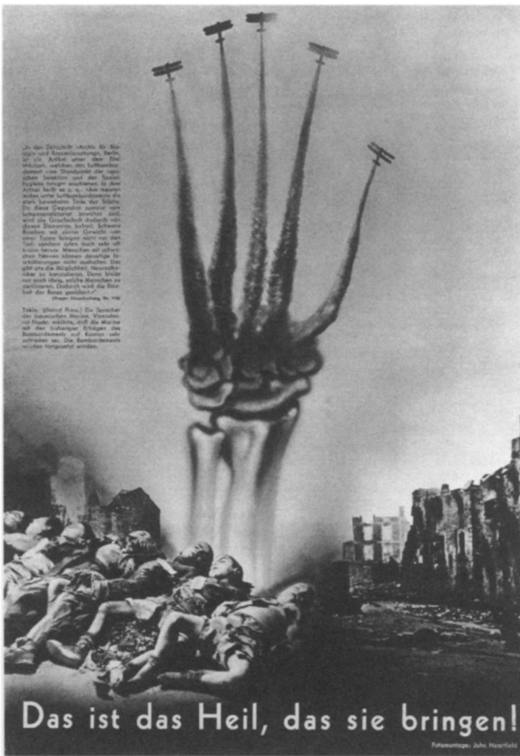
Figure 8. John Heartfield, Das ist das Heil, das sie bringen! ( This Is the Salvation They Bring! ), 1938. © Bildarchiv Preußischer Kulturbesitz, Berlin. © 2008 Artists Rights Society (ARS), New York/VG Bild-Kunst, Bonn

While the seamlessness of German Natural History naturalizes political transformation, the fictional continuity of Das ist das Heil, das sie bringen! ( This Is the Salvation That They Bring! ) of June 29, 1938 (fig. 8), elucidates change by making manifest two phenomena simultaneously. Heartfield has used photographs of airplane stunts to metamorphose into skeletal hands and back again, revealing the militaristic underpinnings of seemingly innocuous aerial acrobatics—the sort one might go see on a Sunday afternoon for entertainment. The exhaust that would normally dematerialize into thin air