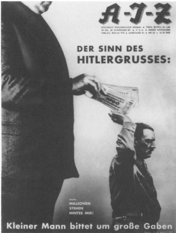
Figure 5. John Heartfield, Der Sinn des Hitlergrusses ( The Meaning of the Hitler Salute ), 1932.

asked to engage with them not as the material product of a series of choices, belief systems, and values but as a natural extension of the world “out there” presented to the viewer in unmediated fashion. We can understand the insistent seamlessness in Heartfield’s AIZ work—its pictorial suture—as an allusion to the illusions, asking the beholder to indulge in their fictions while undermining them through incongruity, distortion, and wordplay.