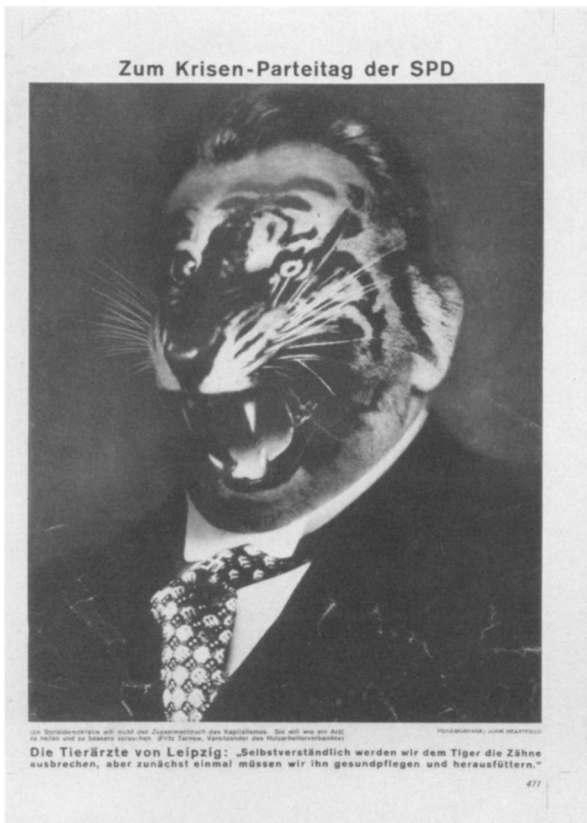
Figure 6. John Heartfield, Zum Krisen-Parteitag der SPD ( On the Occasion of the Crisis Party Conference of the SPD ), 1931. Courtesy Akademie der Künste, Berlin. Kunstsammlung, KS-FS-JH 2520, photograph by Roman März. © 2008 Artists Rights Society (ARS), New York/VG Bild-Kunst, Bonn

pin, insinuating that capitalism, socialism, Nazism, and death are analogous, as interpenetrable as the mutating death's-heads that effortlessly blend into the necktie's fabric. The event that occasioned this nightmarish visage was the 1931 Social Democratic Party conference in Leipzig, whose objective was to come to terms with the escalating world economic crisis. Heartfield's tiger-capitalist, white teeth bared, is an astringent response to the trade unionist Fritz Tarnow's remark: "Social democracy does not want the breakdown of capitalism. Like a doctor, it wants to try to heal and improve it." Tarnow, chair