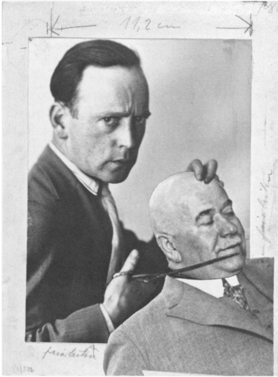
Figure 2. John Heartfield, Self-Portrait with Police President Zörgiebel , mock-up, 1929. Courtesy Akademie der Künste, Berlin. Kunstsammlung, Heartfield 430 © 2008 Artists Rights Society (ARS), New York/VG Bild-Kunst, Bonn

magazines, or Illustrierten , flooding the German market during the 1920s. With a print run of nearly five hundred thousand, it was the second most popular Illustrierte in circulation, outsold only by the left-of-center Berliner Illustrierte Zeitung ( sic ), whose readership extended into the millions. 6 Geared toward a broad-based, left-wing readership, the purpose of the AIZ was to propagate a communist viewpoint to nonparty members and the so-called homeless Left. Its brilliance lay in its ability to speak to the broad spectrum of