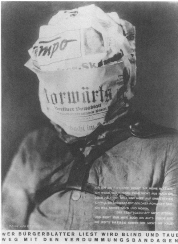
Figure 3. John Heartfield, Wer Bürgerblätter liest wird blind und taub! ( Whoever Reads Bourgeois Papers Becomes Blind and Deaf! ) AIZ, 1930. Courtesy Akademie der Künste, Berlin. Kunstsammlung, JH-F-467, photograph by B. Kuhnert. © 2008 Artists Rights Society (ARS), New York/VG Bild-Kunst, Bonn

a deliberate rejection of disjunctive form. In this portrait a head, mummified by newspapers, asks its viewers by way of the prose in the lower-right corner: “I am a Cabbagehead, do you know my leaves?” Though inquisitive, the man can neither see nor speak, for he is blinded and muted by the newspapers that wrap themselves over his eyes and mouth, enveloping his head. Nor can he hear, according to the boldface type beneath the image, because “whoever reads bourgeois papers becomes blind and deaf.” The bourgeois press, in this instance, refers to Vorwärts , the press organ of the Social Democratic Party, and Tempo , a mainstream socialist paper. The violence of this image operates not on the register of vicious cut-and-paste but on that of psychological