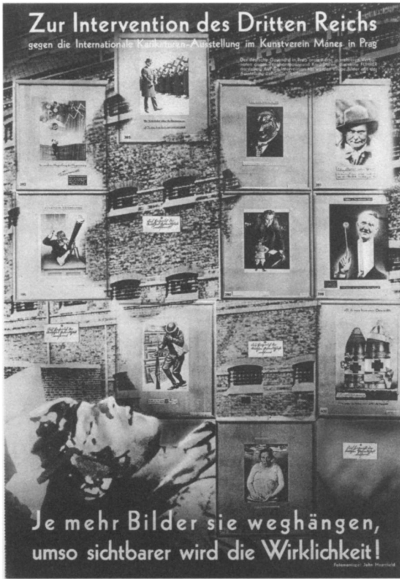
Figure 9. John Heartfield, Zur Intervention des Dritten Reichs ( On the Occasion of the Intervention of the Third Reich ), 1934. © Bildarchiv Preußischer Kulturbesitz, Berlin. © 2008 Artists Rights Society (ARS), New York/VG Bild-Kunst, Bonn

insight, because we cannot transcend our creaturely existence as ideological subjects. To some degree or another, we are all Cabbageheads.