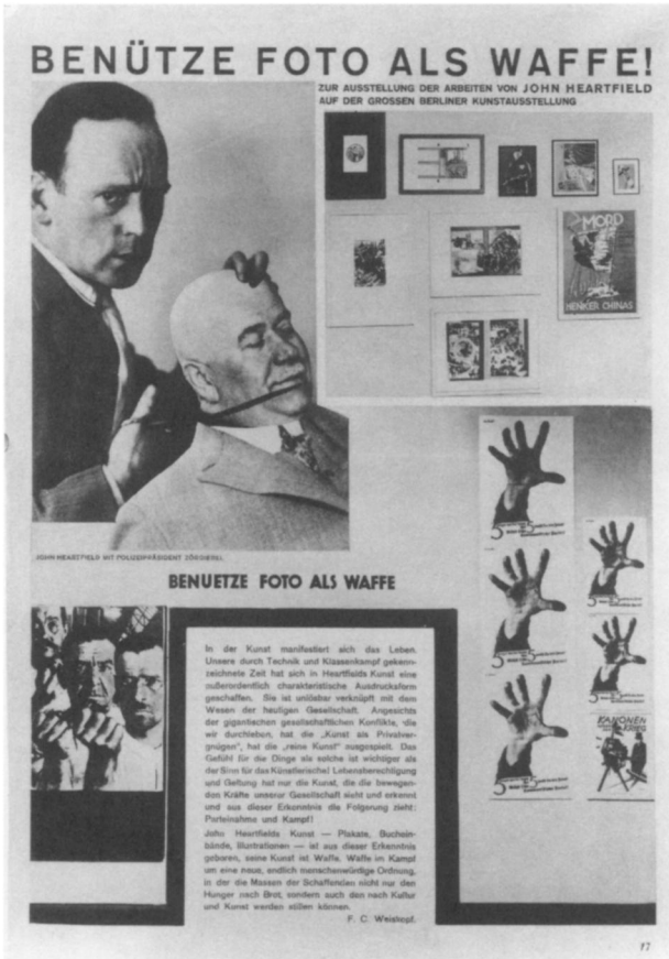
Figure 1. John Heartfield, Self-Portrait , 1929. Courtesy Akademie der Künste, Berlin. Kunstsammlung, Inv. Heartfield 1491/ KS-FS-JH 318. © 2008 Artists Rights Society (ARS), New York/ VG Bild-Kunst, Bonn

1928, Zörgiebel prohibited all outdoor meetings and demonstrations in response to violent street clashes between and among communists, socialists, and National Socialists. He then extended the prohibition to include the May Day marches, a highly symbolic annual working-class tradition (socialist as well as communist) that demonstrated working-class pride and solidarity. The communists, taking this gesture as provocation by the socialist regime, appeared en masse to protest Zörgiebel's prohibition peaceably, only to be met by specially